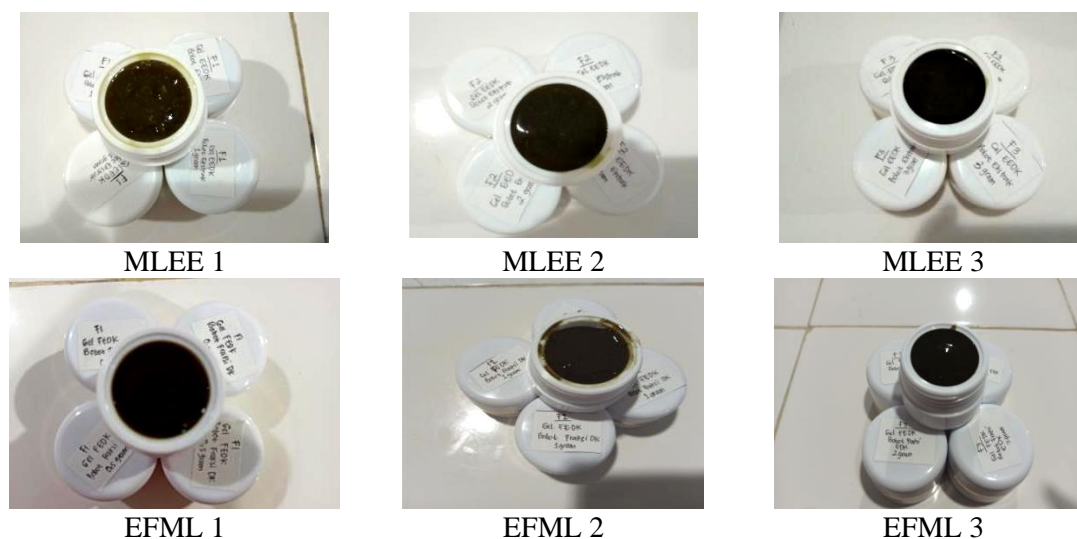
Figure 2. Gel of MLEE (Moringa leaf ethanolic extract) and EFML (Ethyl acetate fraction of Moringa leaves)

The test results in Table II show that EFML 3 has good adhesion compared to F1, F2 and gel base. The EFML F1 gel formula has the longest adhesion time of 57.44 seconds compared to F2 (14.11 seconds) and F3 (16.71 seconds).